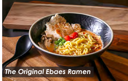
The Original Ebaes Ramen