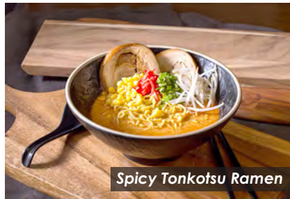
Spicy Tonkotsu Ramen