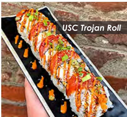
USC Trojan Roll