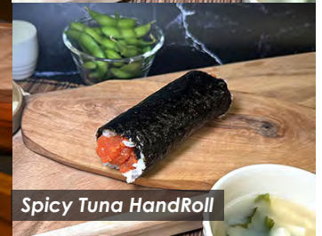
Spicy Tuna HandRoll