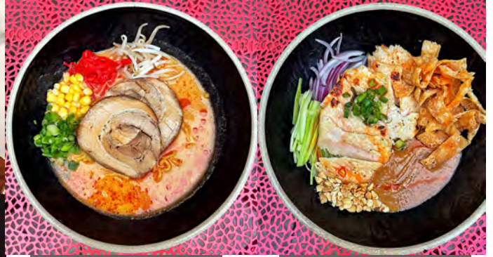
Spicy Tonkotsu Ramen