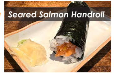
Seared Salmon Handroll