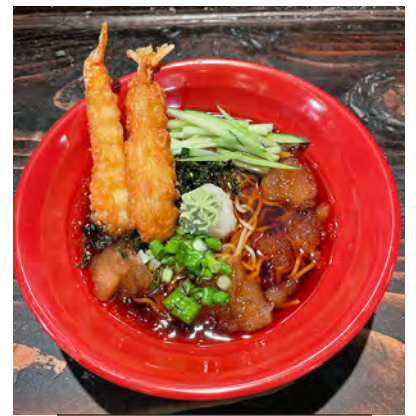
Cold Bae Ramen