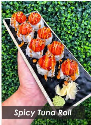
Spicy Tuna Roll

Tuna(2), Salmon(2), Yellowtail(1), ebi shrimp(1), Unagi (1), Seared Salmon(1)