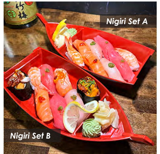
Nigiri Set A