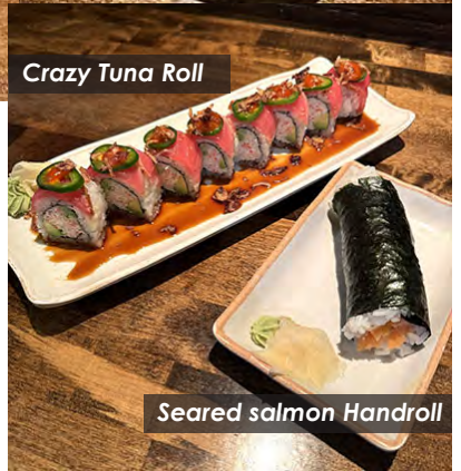
Crazy Tuna Roll