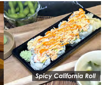
Spicy California Roll