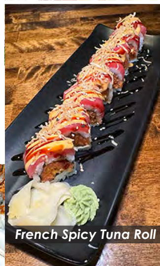
French Spicy Tuna Roll