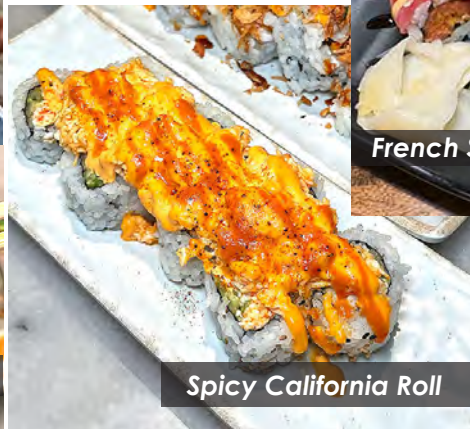
Spicy California Roll