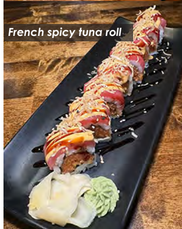
French spicy tuna roll