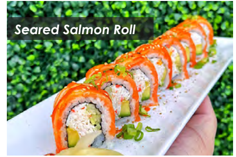
Seared Salmon Roll