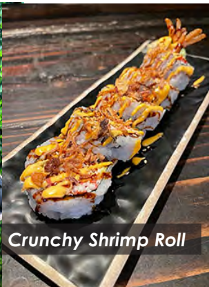
Crunchy Shrimp Roll