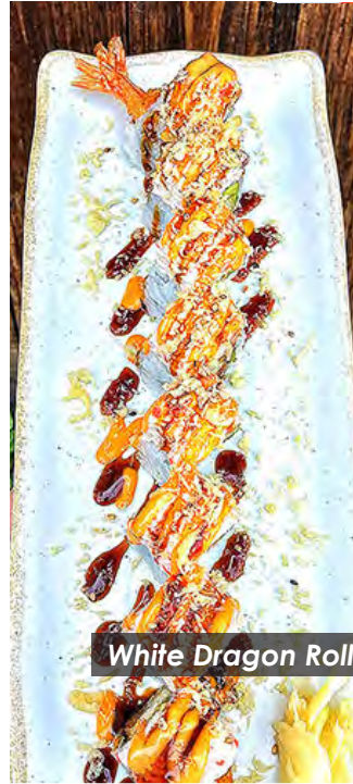
White Dragon Roll