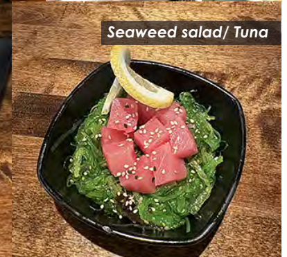
Seaweed salad/ Tuna